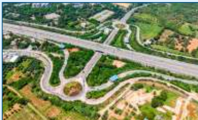
Outer Ring Road